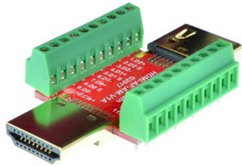
Figure 4: HDMI-AF-AM-V1A with terminal blocks