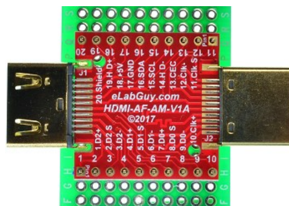
Figure 2: Example of connecting the HDMI-AF-AM-V1A on a proto PCB (Note: This picture only shows the pins spacing, actual use may not be used on a breadboard)