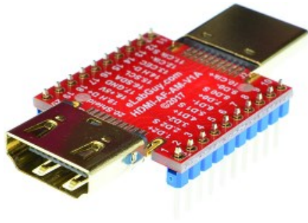
Figure 3: HDMI-AF-AM-V1A with headers