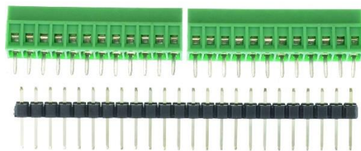
Figure 1: Parts inside the kit (Note: the module is not assembled, user can decide which connector to use on the module.)