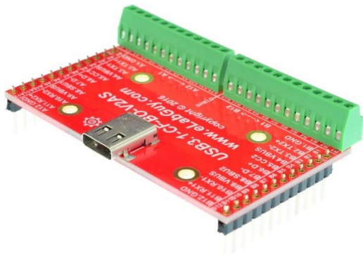
Figure 3: USB3.1-CF-BO-V2AS with headers on side