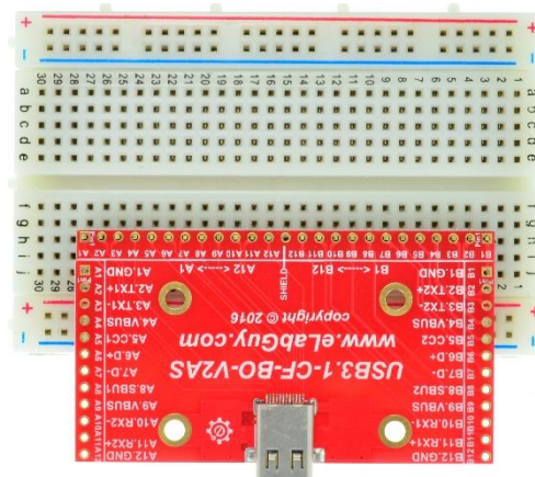
Figure 2: Example of connecting the USB3.1-CF-BO-V2AS on a breadboard