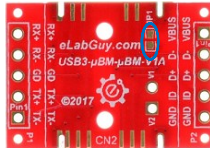
Figure 6: PCB back with optional Jumper connects Shield to GND