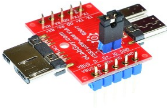
Figure 3: USB3-uBM-uBM-V1A with headers