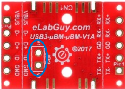
Figure 5: PCB front with open circuit on VCC pin in series