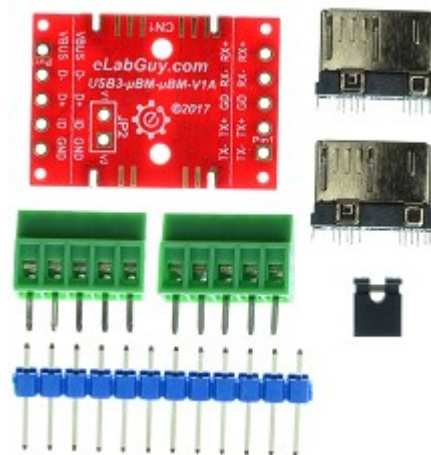
Figure 1: Parts inside the kit (Note: the module is not assembled, user can decide which connector to use on the module.)