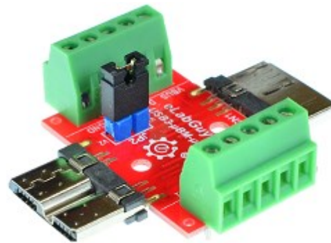
Figure 4: USB3-uBM-uBM-V1A with terminal blocks