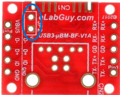
Figure 5: PCB front with open circuit on VCC pin in series