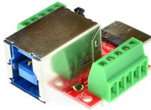
Figure 4: USB3-uBM-BF-V1A with terminal blocks