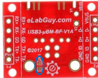
Figure 6: PCB back with optional Jumper connects Shield to GND