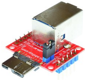
Figure 3: USB3-uBM-BF-V1A with headers