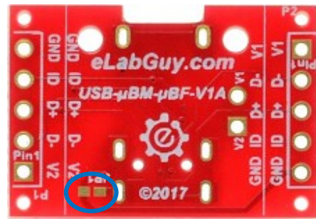
Figure 6: PCB back with optional Jumper connects Shield to GND