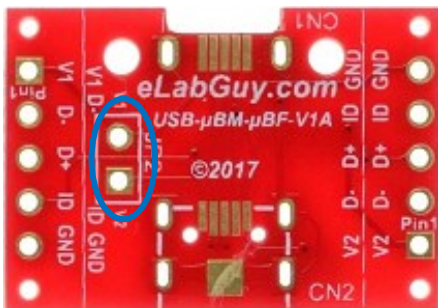
Figure 5: PCB front with open circuit on VCC pin in series