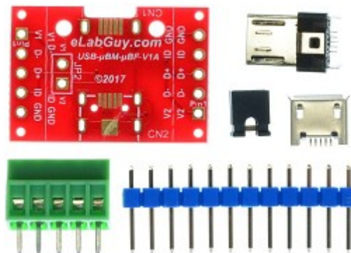
Figure 1: Parts inside the kit (Note: the module is not assembled, user can decide which connector to use on the module.)