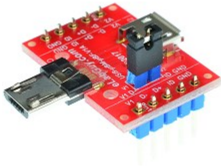
Figure 3: USB-uBM-uBF-V1A with headers