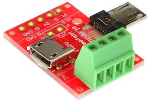
Figure 4: USB-uBM-uBF-V1A with terminal blocks