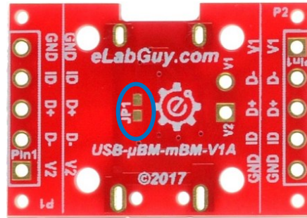
Figure 6: PCB back with optional Jumper connects Shield to GND