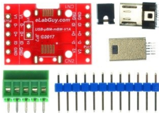
Figure 1: Parts inside the kit (Note: the module is not assembled, user can decide which connector to use on the module.)