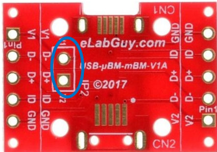
Figure 5: PCB front with open circuit on VCC pin in series