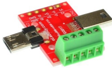
Figure 4: USB-uBM-mBM-V1A with terminal blocks