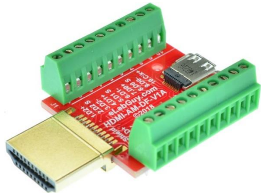
Figure 4: HDMI-AM-DF-V1A with terminal blocks