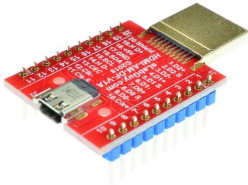
Figure 3: HDMI-AM-DF-V1A with headers