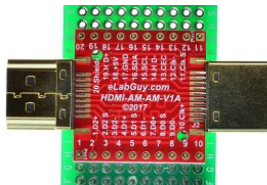
Figure 2: Example of connecting the HDMI-AM-AM-V1A on a proto PCB (Note: This picture only shows the pins spacing, actual use may not be used on a breadboard)