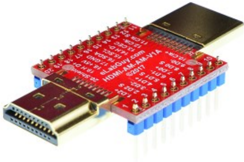
Figure 3: HDMI-AM-AM-V1A with headers