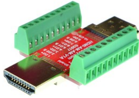
Figure 4: HDMI-AM-AM-V1A with terminal blocks