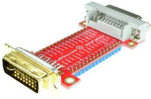
Figure 3: DVI-IM-IM-V1A with headers