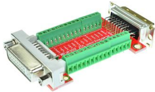
Figure 4: DVI-IM-IM-V1A with terminal block