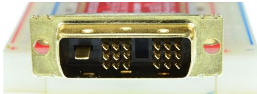
Figure 6: DVI-D single link male