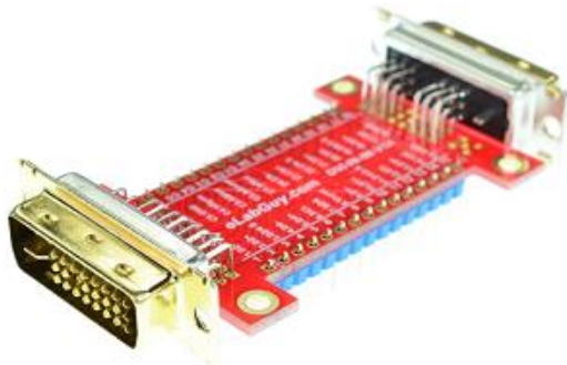
Figure 3: DVI-IM-DSM-V1A with headers