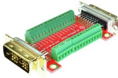
Figure 4: DVI-IM-DSM-V1A with terminal block