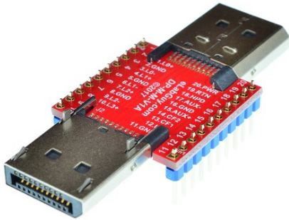
Figure 3: DP-M-M-V1A with headers