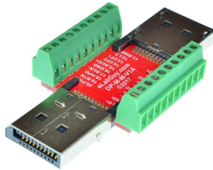
Figure 4: DP-M-M-V1A with terminal blocks