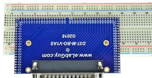
Figure 2: Attaching the D37-BO-V1AS on a breadboard