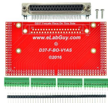
Figure 1: Parts inside the kit (Note: the module is not assembled, user can decide which connection to use on the module.)