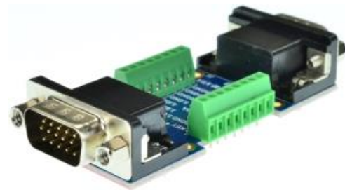
Figure 4: D15HD-M-M-V1A with terminal blocks

Caution!! When assembling the D15HD-M-M-V1A, please make sure you place the connector on the right side.