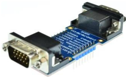
Figure 3: D15HD-M-M-V1A with headers