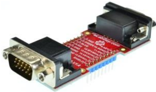
Figure 3: D15HD-F-M-V1A with headers