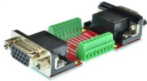
Figure 4: D15HD-F-M-V1A with terminal blocks